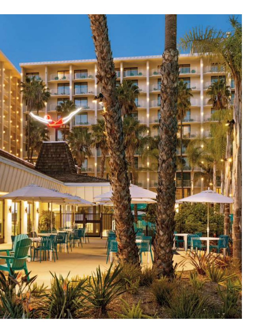
CLOCKWISE FROM TOP LEFT: MONKEY BAR; LAPPER KITCHEN + TAP; TWISTER WATERSLIDE; ARLO

For a break from the activity, head to the Regency Tower for a more relaxed, contemplative pool experience. Be sure to take a photo on the giant oversized beach chair that invites you to flamingle with it by the main pool complex.